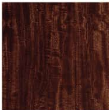
WX742| BRANDY FINISHES: HIGH GLOSS, SUPER MATTE, AND TEXTURE