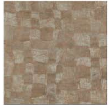
PT231 | TAUPE PAPYRUS FINISHES: SUPER MATTE AND TEXTURE