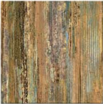
PO222 | CORRUGATED TIN FINISH: FR FINISH