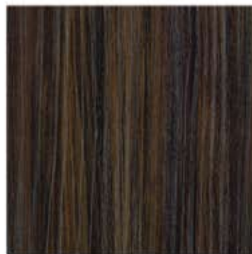
WE029 | CENTRUM FINISHES: HIGH GLOSS, SUPER MATTE, AND TEXTURE