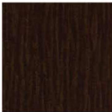
WY041 | COPPER BRAID FINISHES: HIGH GLOSS, SUPER MATTE, AND TEXTURE