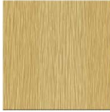
WE911 | COCONUT FINISHES: HIGH GLOSS, SUPER MATTE AND RW FINISH