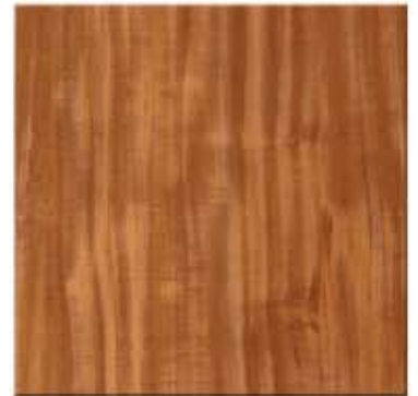
WN805 | CINNAMON CHESTNUT FINISHES: HIGH GLOSS, SUPER MATTE, AND TEXTURE