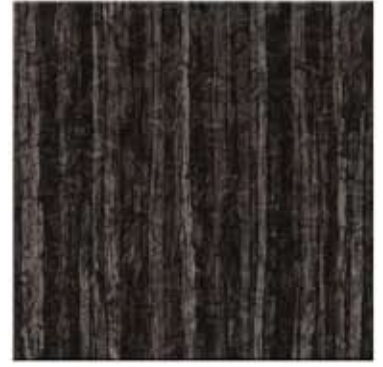
PE021 | EBONY BARK FINISHES: HIGH GLOSS, TEXTURE