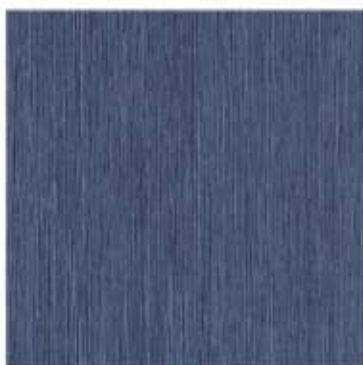
PB050| BLUEBERRY STRAND FINISHES: HIGH GLOSS, TEXTURE