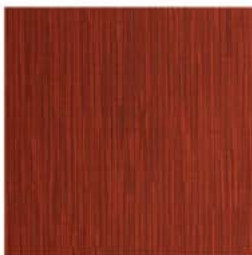
PR141| CHILE MESH FINISH: TEXTURE