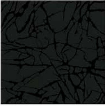
SE3055 | BLACK ICE FINISH: GRAPHIX