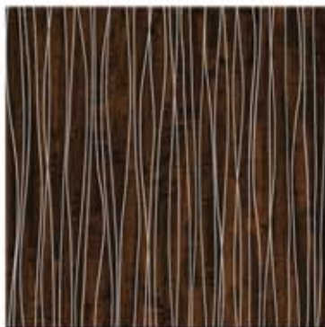
WXC03| BRANDY COMET FINISHES: HIGH GLOSS, SUPER MATTE, AND TEXTURE