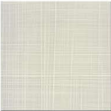
PG003 | CLAY TESSERACT FINISHES: HIGH GLOSS AND TEXTURE