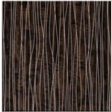
WXC05 | COAL COMET FINISHES: HIGH GLOSS, SUPER MATTE AND TEXTURE