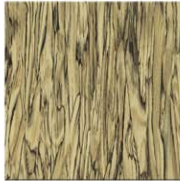
PT021 | NATURAL RECLAIM FINISH: TEXTURE