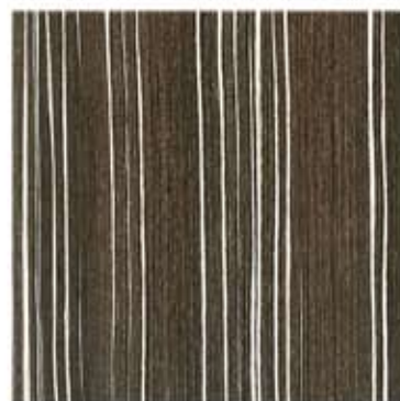
WX061| SHADOW TINEO FINISH: LS FINISH