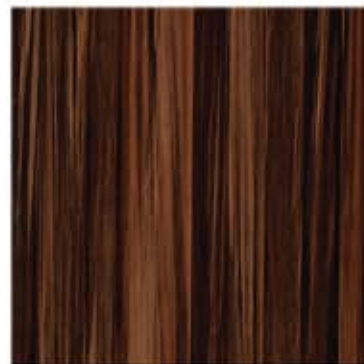
WX437| TIGER-EYE SILKWOOD FINISHES: HIGH GLOSS, SUPER MATTE, AND TEXTURE