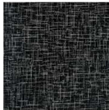
PE033 | EBONY RETRO FINISHES: HIGH GLOSS AND TEXTURE