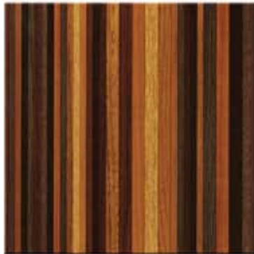
WE701 | STAINED STRIPEWOOD FINISHES: HIGH GLOSS AND TEXTURE