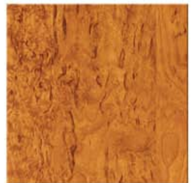
WB001 | ICE BIRCH FINISH: SUEDE