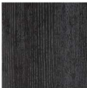
WA100 | TOURMALINE FINISH: LS FINISH