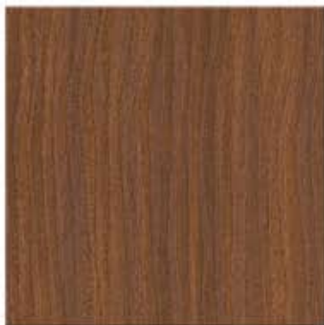
PE109| CINNAMON FERN FINISH: HAND SCRAPPED

Lab Designs™ has taken the best patterns available worldwide and combined them with our own fresh new designs, colors and textures to create the first high-end laminate collections without the high-end price. With over 400 patterns available, from abstract, wood, and solid color laminates, there's plenty of looks to choose from. Lab Designs have the same durability and flexibility in application as other laminates, giving you the opportunity to develop your designs with the very best products, for a great price.